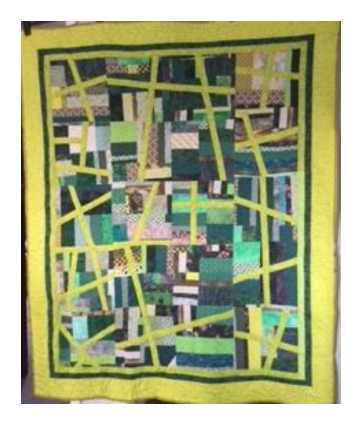
Kintsugi Style Quilts with Anita Birtles Tuesday 27<sup>th</sup> August 10.30am to 4.30pm

32 Bridge Road, East Molesey, Surrey, KT8 9HA, Tel: 020 8941 7075